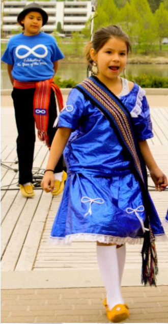
St. Mary's School Jiggers Saskatoon

Regrettably, it's that time of year again. The air outside is getting colder, the sunny days are slowly getting shorter and being replaced by dreary days. Summer has ended and autumn is upon us.